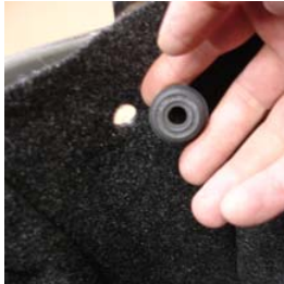
Position Lining in Bag and reinstall grommets. These act as locator pins to position lining into place.