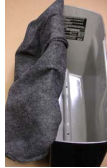
Pull the lining out so you can now spray adhesive.