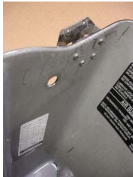
Remove rubber grommets. Leave bracket attached.