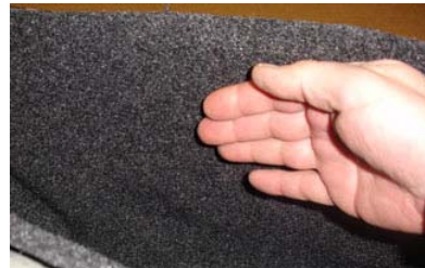
Smooth out the wrinkles on the 3 sides you have sprayed. Remove grommets and spray remaining sides with adhesive, then smooth out wrinkles.