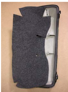
Place Lining into Lid interior to see how it fits.