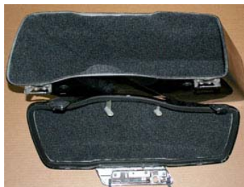
Allow bags and lids 1/2 hour to completely dry. They are now ready to reinstall hinge and put back on your bike.