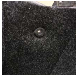
With grommets in place you can now locate lining into position: side to side and back to front.