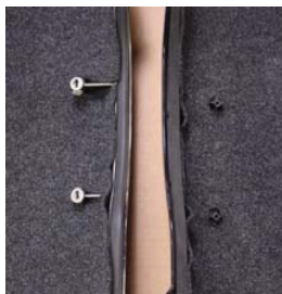
Notice the difference in the lids. The lid on the left is the earlier model and on the right, the later model. Make sure you have the correct kit.