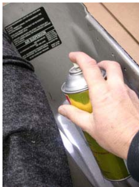
Before spraying, mask the lip of the box for overspray. Spray adhesive on the floor, one end and one side.