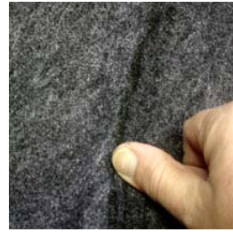
See seams in lining. Smooth out seams with your thumb. They will disappear when finished installing lining.