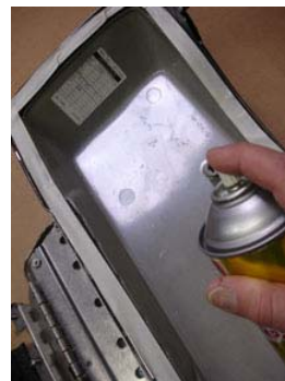
Mask the seal, then spray the surface liberally so the lining slides with ease into place.