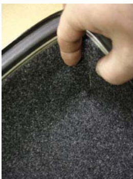
Push seams together and smoother out with thumb.