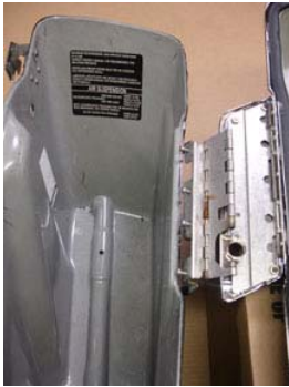
Remove Lid, leave hinge attached to lid.

Remove Bags, Clean Interior, Read all Instructions then begin installing lining.