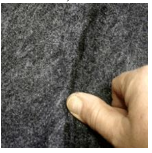
3: See inside of lining. Smooth out seams, they will disappear when install is complete.