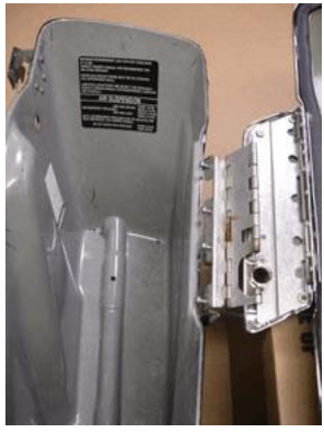
1: Remove lids with hinge attached to lid.