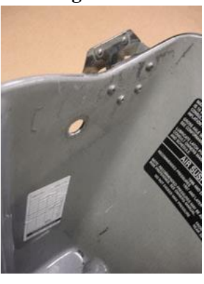
2: Remove rubber grommets but leave bracket on.