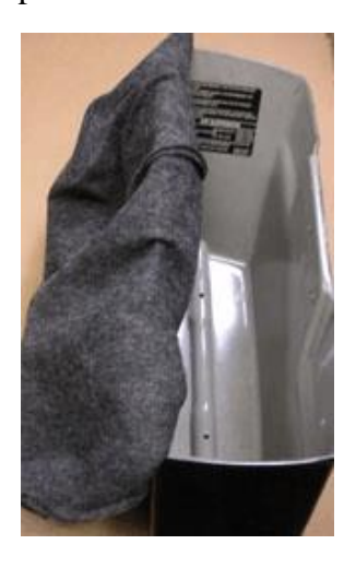
6: Pull the lining out so you can now begin to spray the included adhesive.