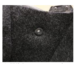
5: With grommets in position you can now locate lining in the bag, side to side and front to back.